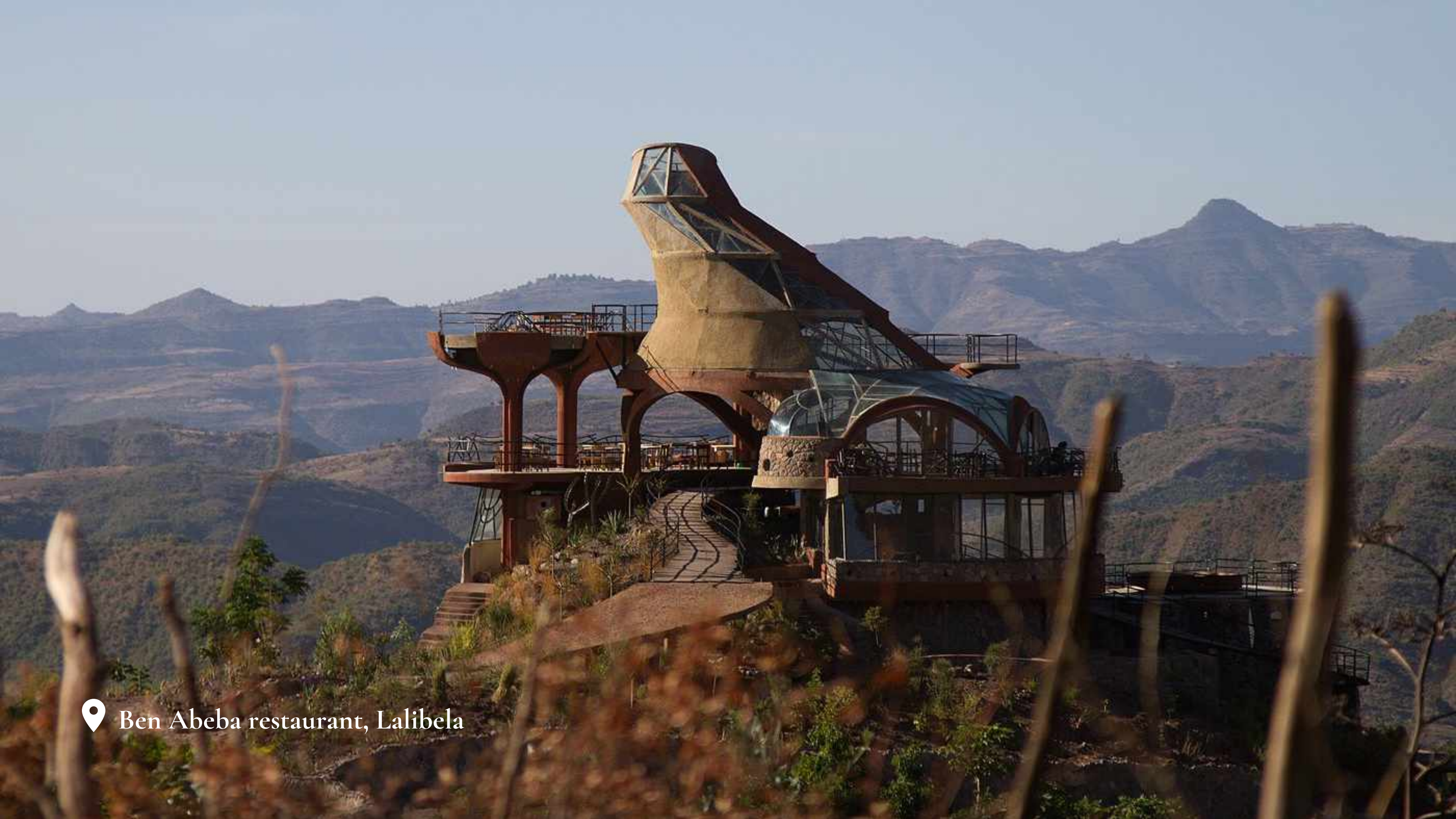
📍 Ben Abeba restaurant, Lalibela