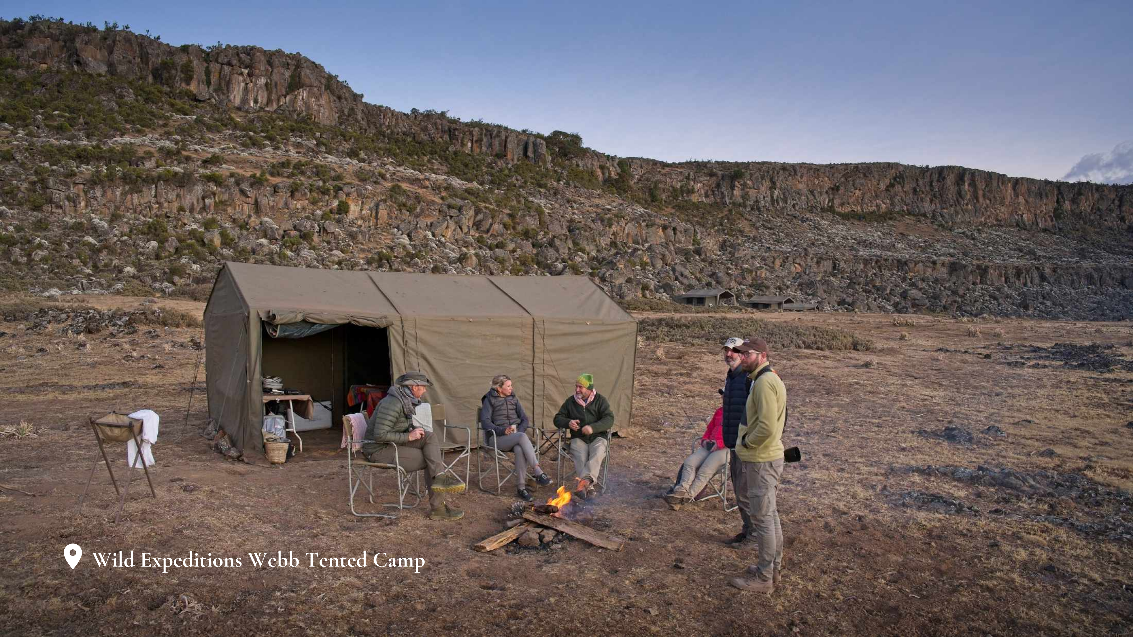
📍 Wild Expeditions Webb Tented Camp