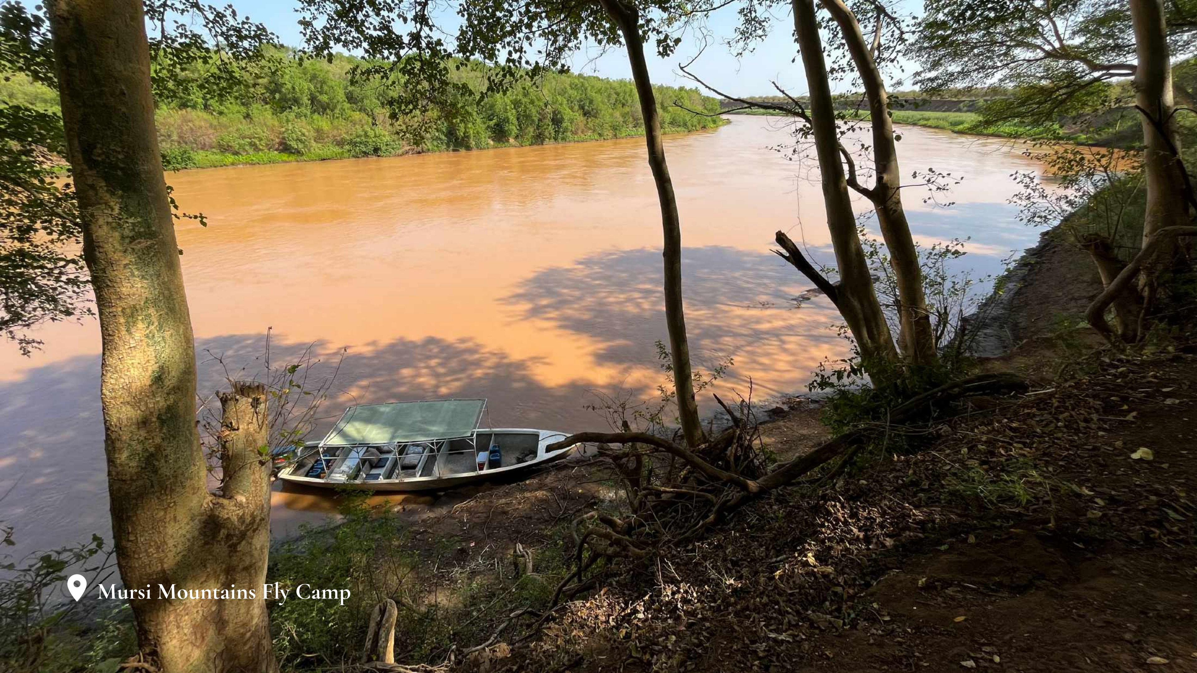
📍 Mursi Mountains Fly Camp