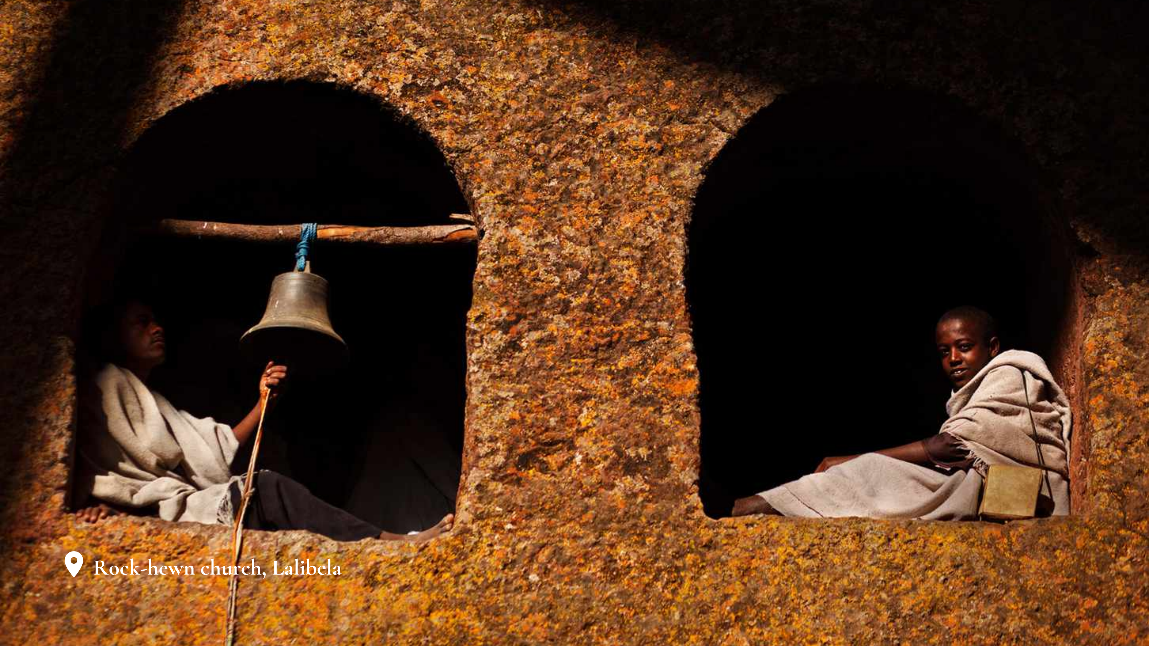
📍 Rock-hewn church, Lalibela