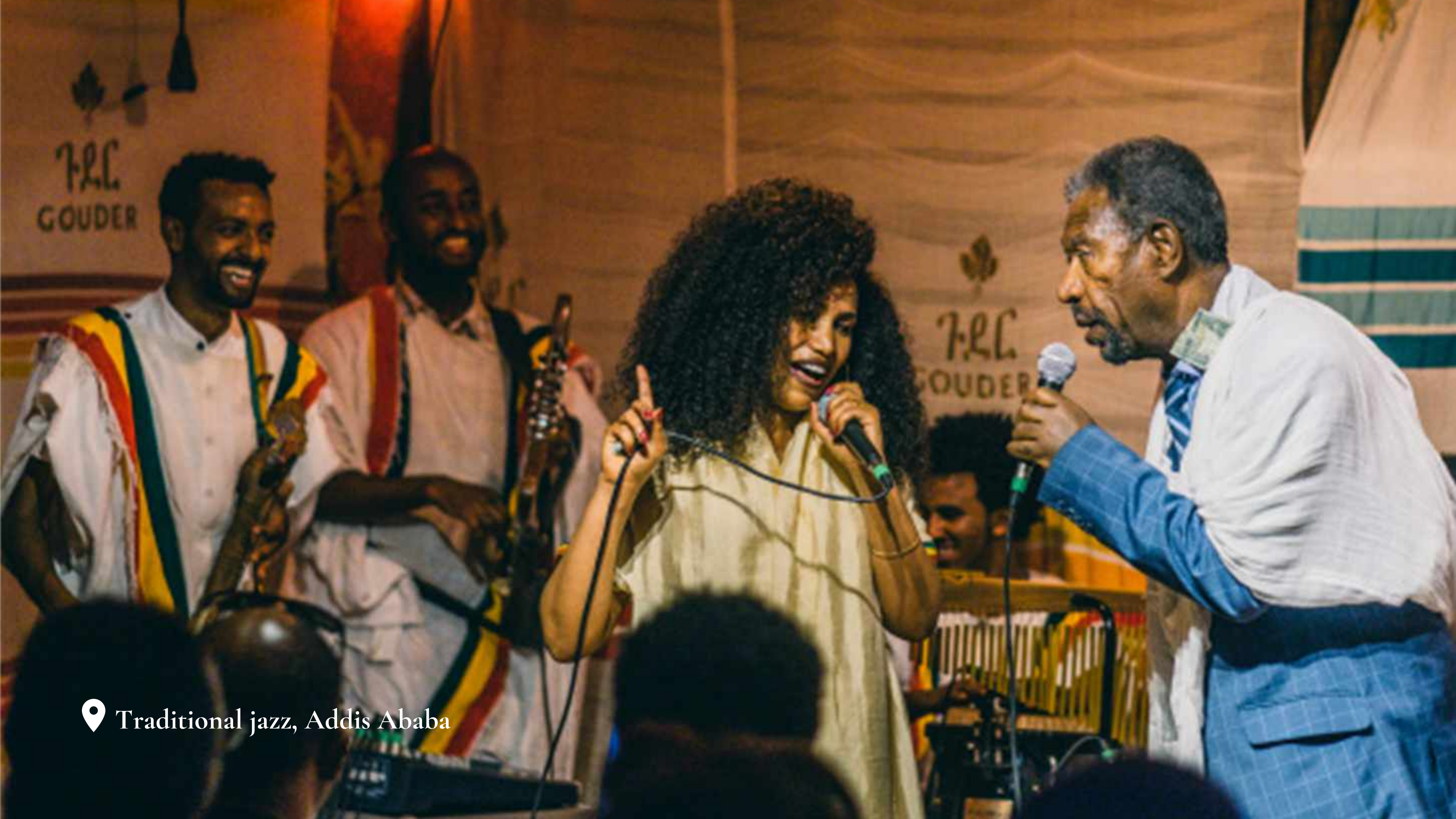
📍 Traditional jazz, Addis Ababa