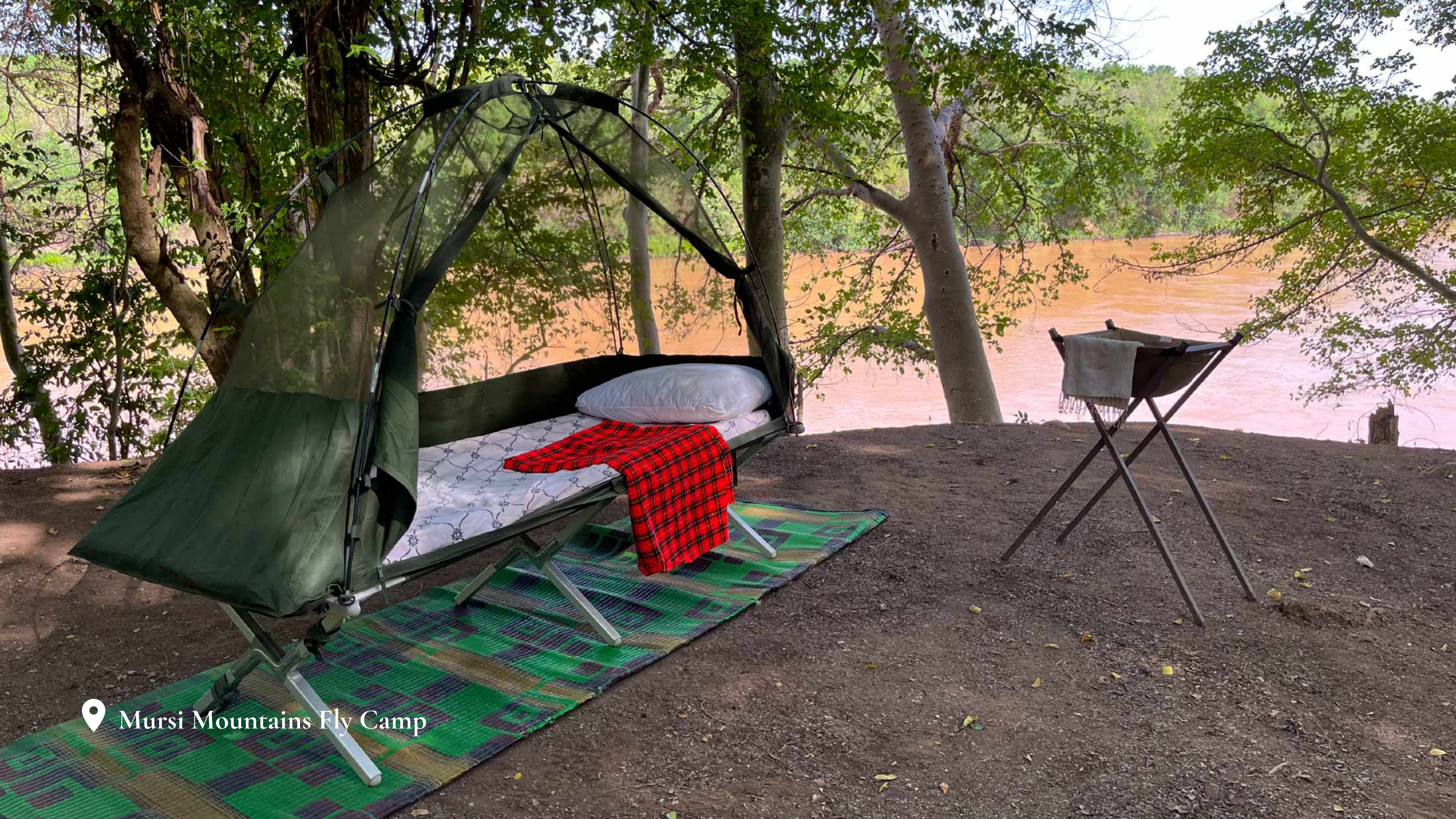
📍 Mursi Mountains Fly Camp