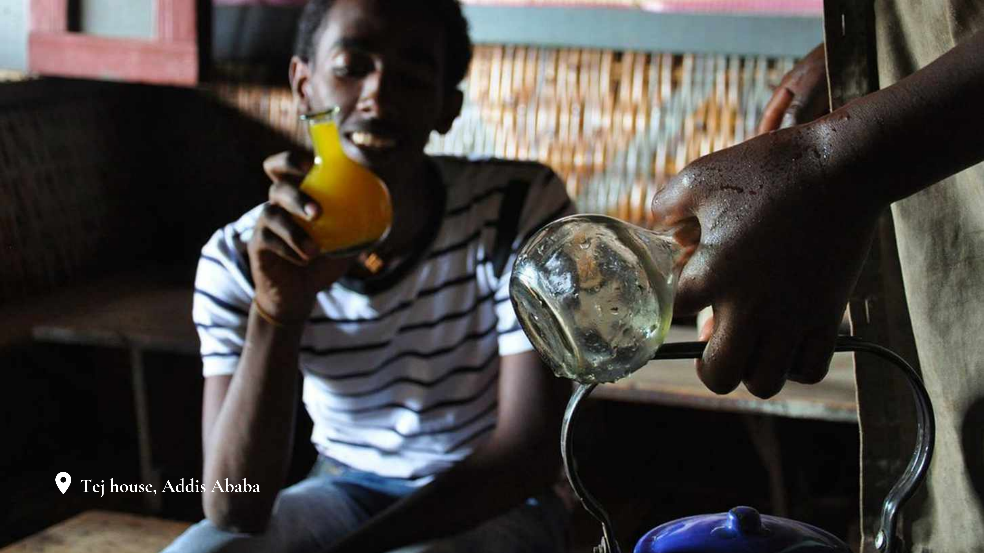
📍 Tej house, Addis Ababa