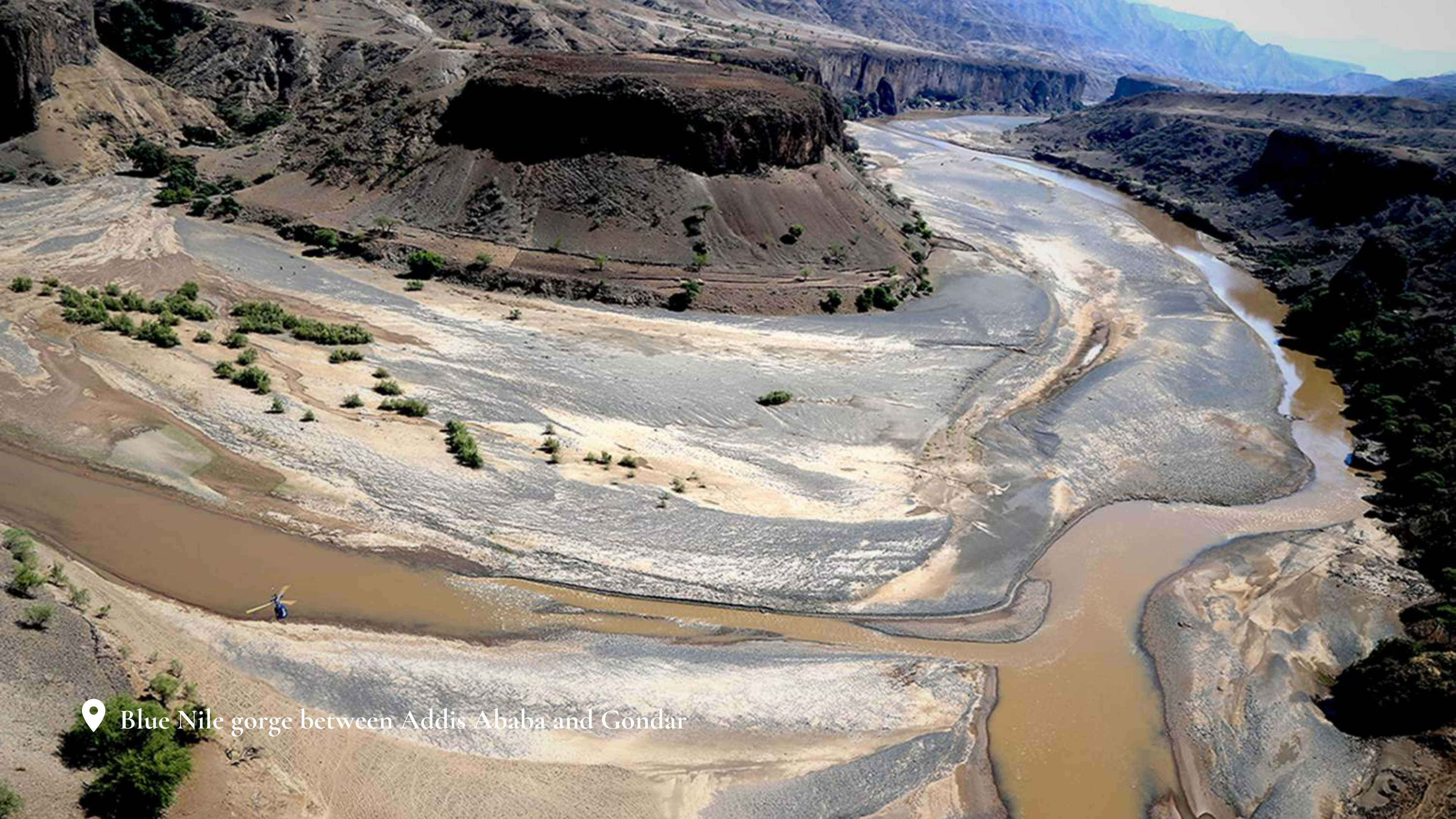
📍 Blue Nile gorge between Addis Ababa and Gondar